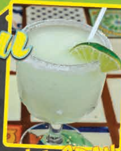
LA GRAN MARGARITA